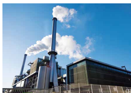
Waste incineration plant